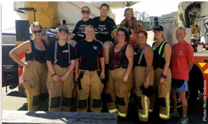
UFBA 2016 National Firefighter Combat Challenge, Wellington