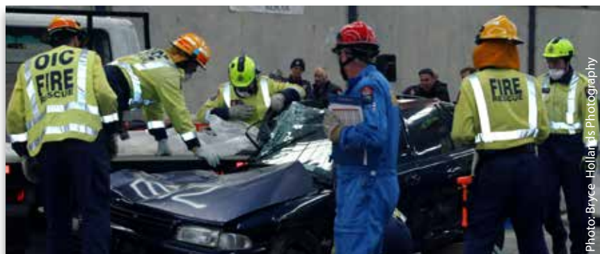
UFBA 2016 National Road Crash Rescue Challenge, Inglewood