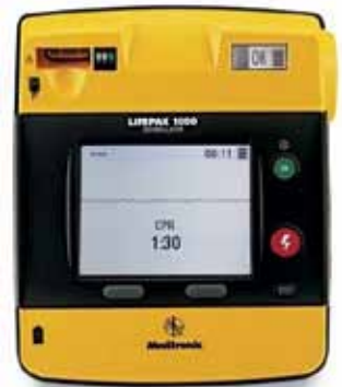
Medux Lifepak 1000 unit

Watch out for updates from the NZFS about when your brigade will receive theirs and any training required to transition to the new unit.