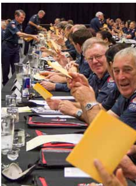
Voting gets underway