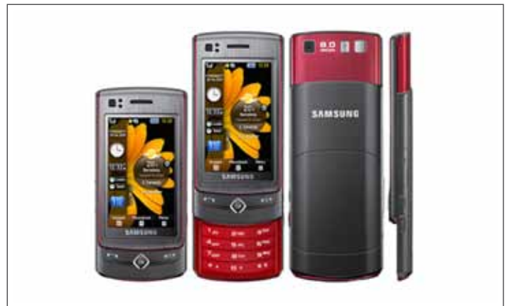
Samsung S8300T touch screen cellphone

You must be currently in a UFBA-member brigade, or a former member with at least five years of service, to be a member of the site. Once you register, the UFBA will check your eligibility in our database and approve your request within one business day. If you do not appear in our database, we may contact you or your CFO for verification.