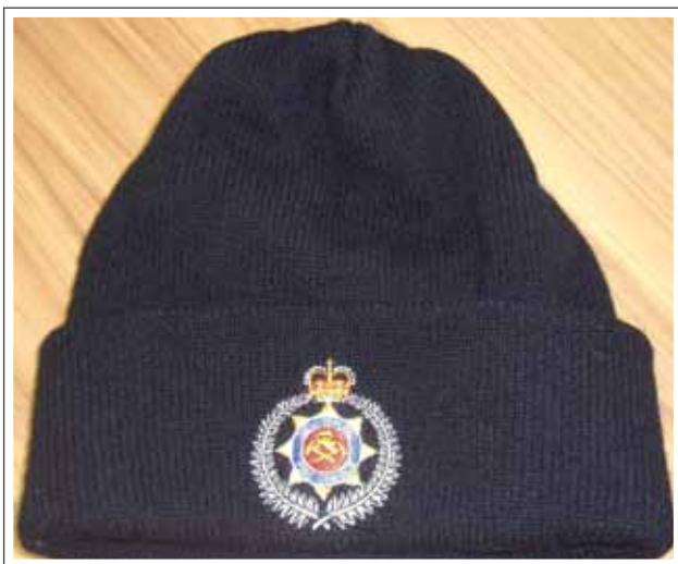
Code 1441 – NZFS 100% Merino Wool Beanie $19.00