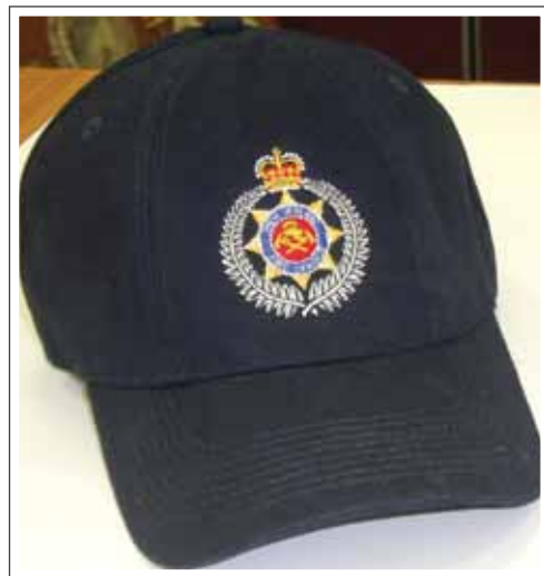
Code 1009 – NZFS Baseball Cap $18.00