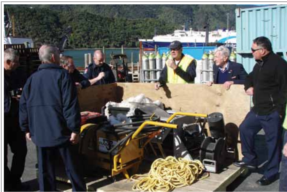
NZFBI field day participants learn about oil spill equipment at the Picton Wharf.

If you'd like to find out about hosting a field day with the NZFBI, contact ian.wellings@fire.org.nz