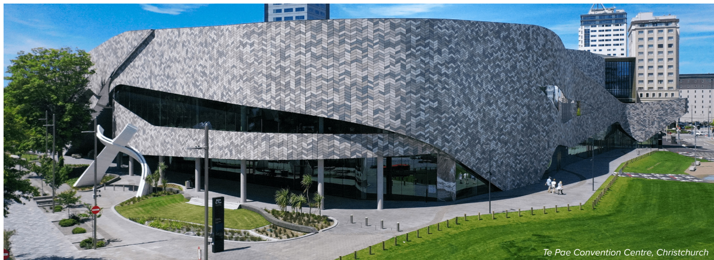
Te Pae Convention Centre, Christchurch